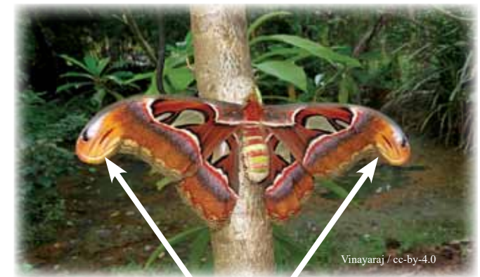
Vinayaraj / cc-by-4.0