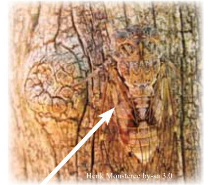
Henk Monsterec by-sa 3.0