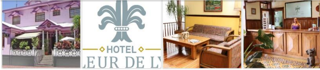
More photos of Hotel Fleur de Lys